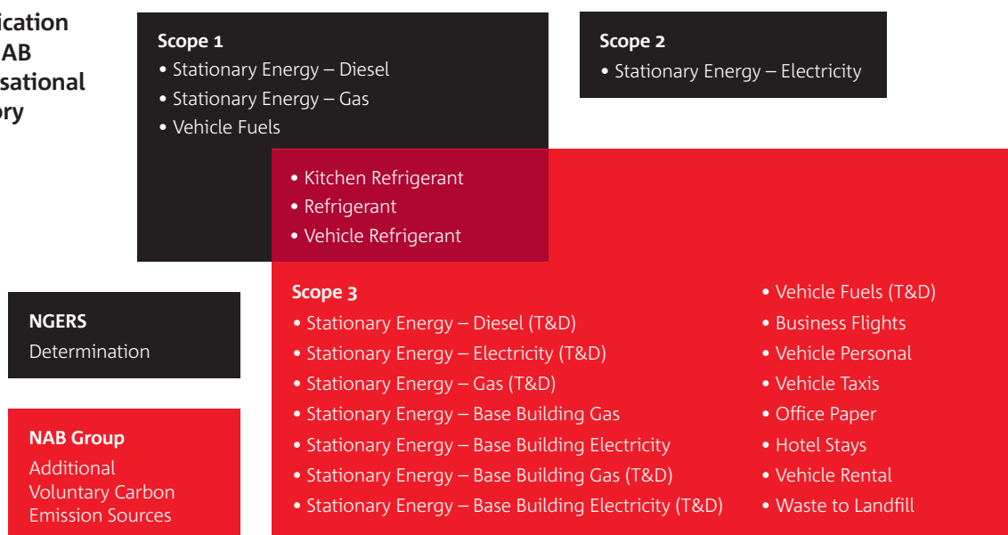
Figure 1: Certification Boundary for NAB Group's Organisational Carbon Inventory

Figure 1 below illustrates the certification boundary for NAB's organisational carbon inventory.